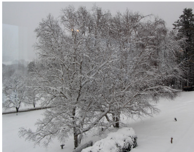
Snow began Friday late afternoon and continued for almost 24 hrs! Total 10"