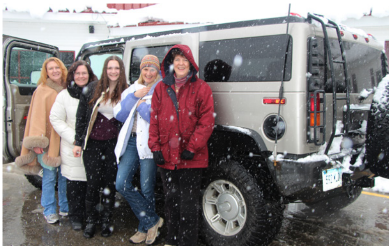
No problem driving from CT, this group rode in a Hummer!