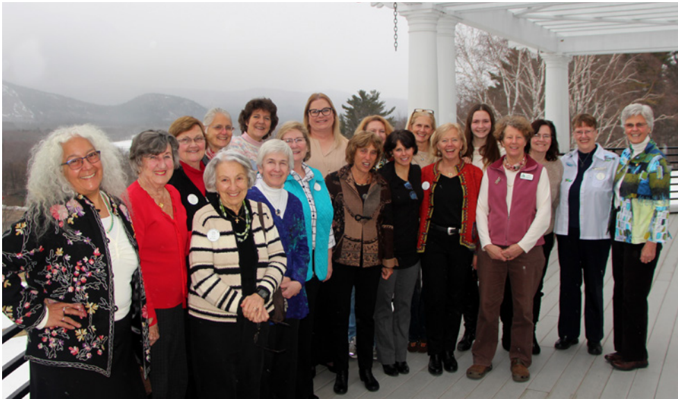
Group photo by Rae Willis