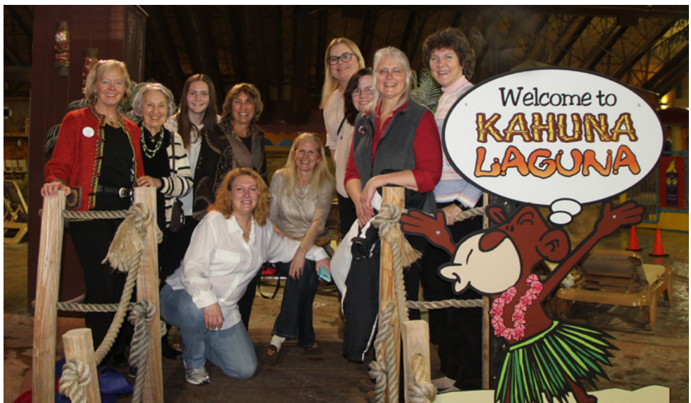
Tour of the indoor water park that was attached to the Red Jacket Resort