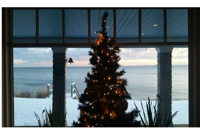
The view from Nancy's window