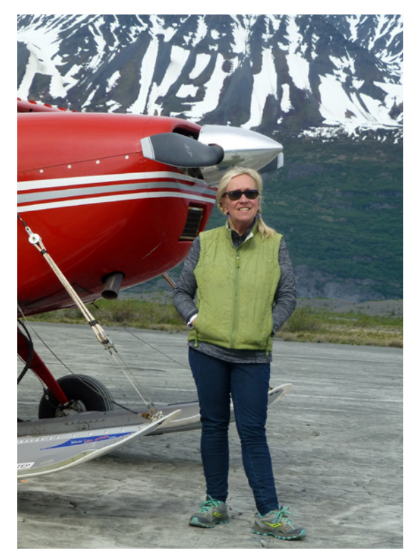
Knik Glacier in Alaska, during a training flight

I am an automotive journalist and author. I travel the globe test driving cars and trucks, working for magazines, newspapers, television, radio and the Internet to provide vehicle reviews, as well as adventure stories about racing and automotive expeditions throughout the world.