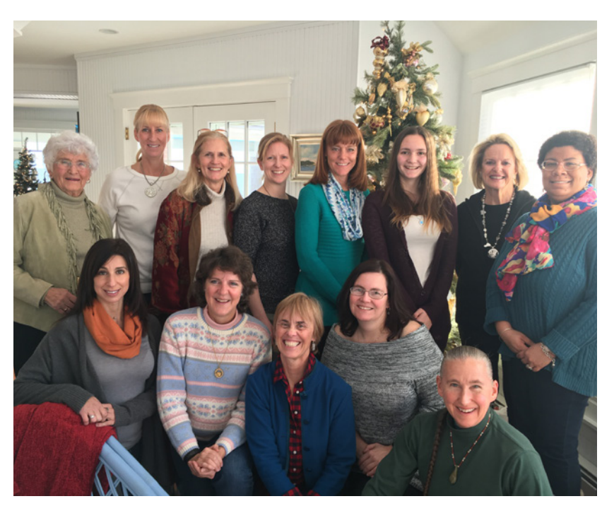
Lots of smiles!