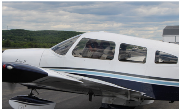
Donna Shea flew the Poker Run in a CT Flight Club plane