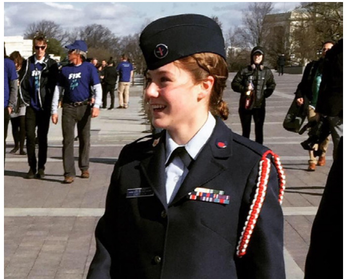
Cadet Master Sergeant with the Civil Air Patrol, 186th Squadron out of Robertson Airport