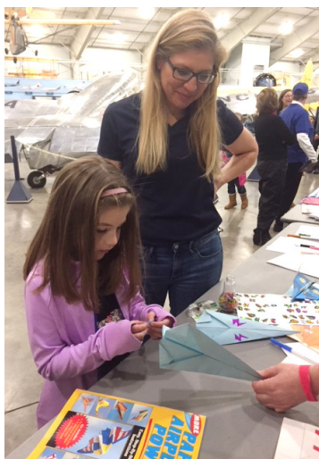
Mother & Daughter enjoy interacting with the 99s