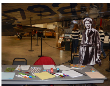
Amelia Earhart joined us too!