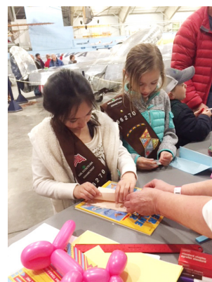
Over 500 people visited the Museum!