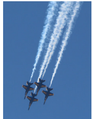
The Blue Angels excite the crowd!