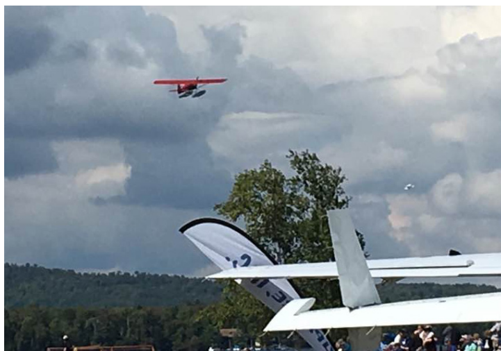
International Seaplane Fly-in in Greenville, Maine