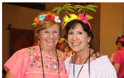
Co-Chairmen of the Conference