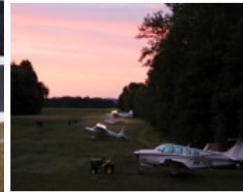
NEW ENGLAND RACERS;