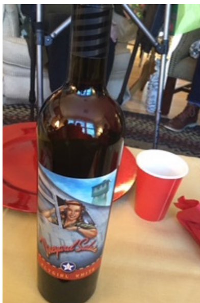
Photos of Yankee Swap