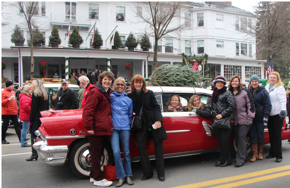
CT Chapter members taking part in the recreation of Norman Rockwell's "Stockbridge at Christmas" painting