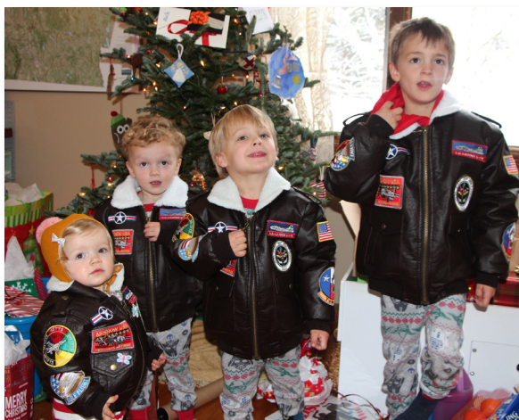
Flight jackets were a hit for my grandchildren!

(see more info at the end of this newsletter)