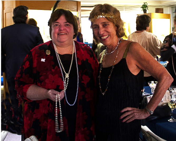
New England Flappers

At 99s HQ Saturday night, the 99s celebrated in vintage dress of the 1920's. Style & creativity abounded!