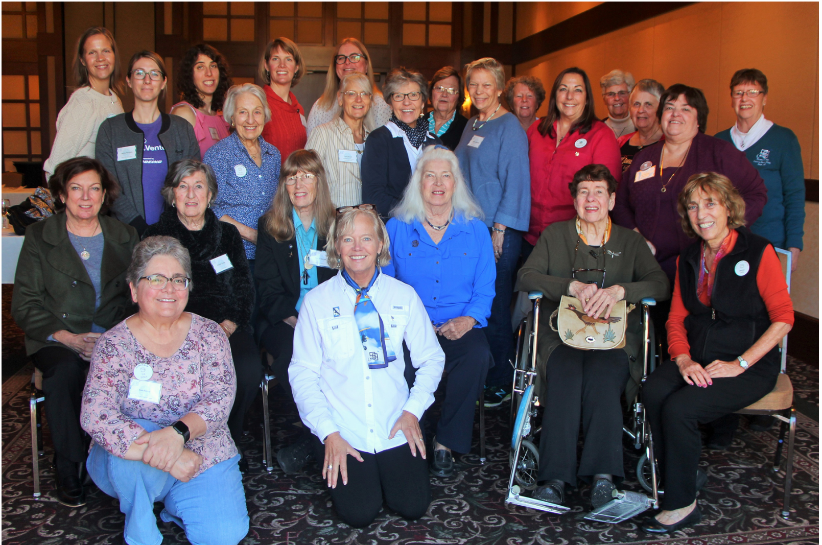
99s Fall Section Attendees at Beechwood Hotel, Worcester, MA