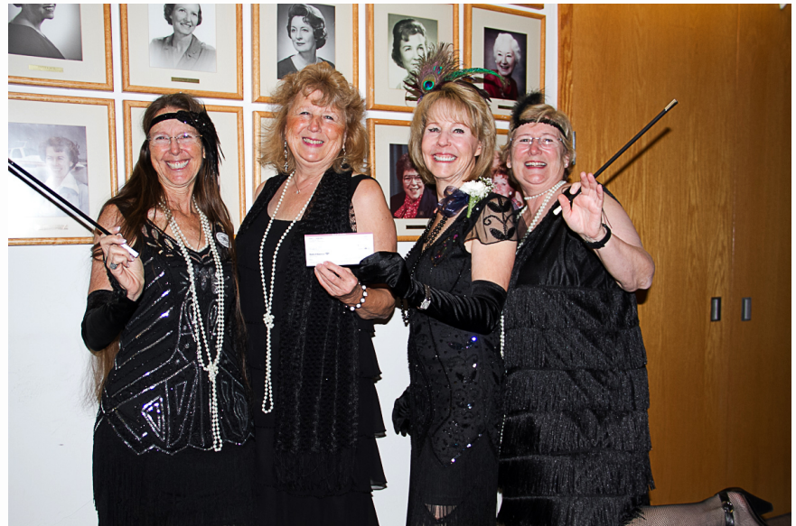
International Board Flappers

More photos and news of the 90th Celebration is forthcoming from Headquarters. Watch for it in the next issue of the 99s Magazine.