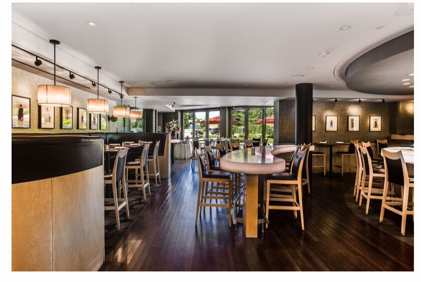
Here at Social Hour, a man called his daughter. " You have to come down. The room is full of women pilots!"