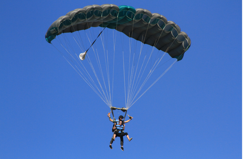
Sky-Divers jumped from a DC 3 onto the field.

Simsbury Air Show September 22, 2019 (Introduction of a new Display Tent)