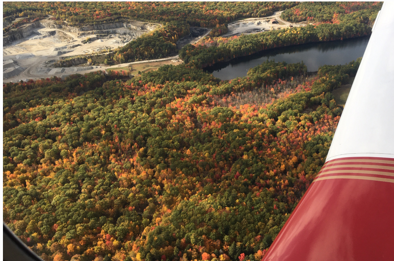
New England foliage at its peak!