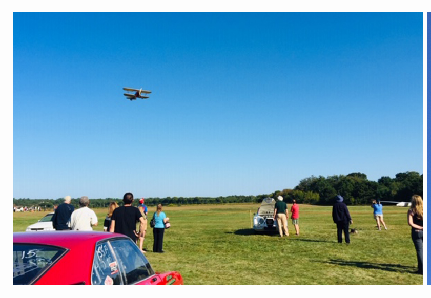
Bi-Planes rides were available over the grass field to ocean