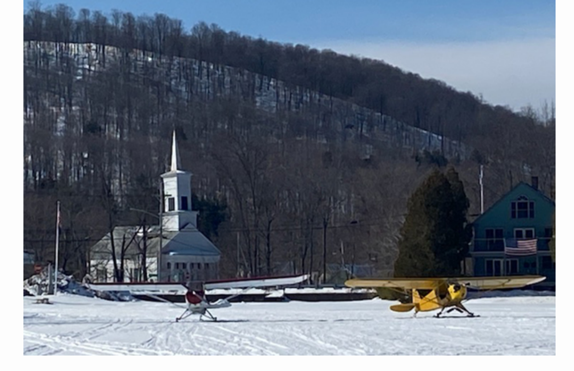
Aeronca Champ & Piper Cub (both 1947) on Silver Lake, Vt.

There is news & photos from NE Members below. We always love to hear from you. Send yours anytime! I'll be reporting back from HQ and news there in the next Squawk.