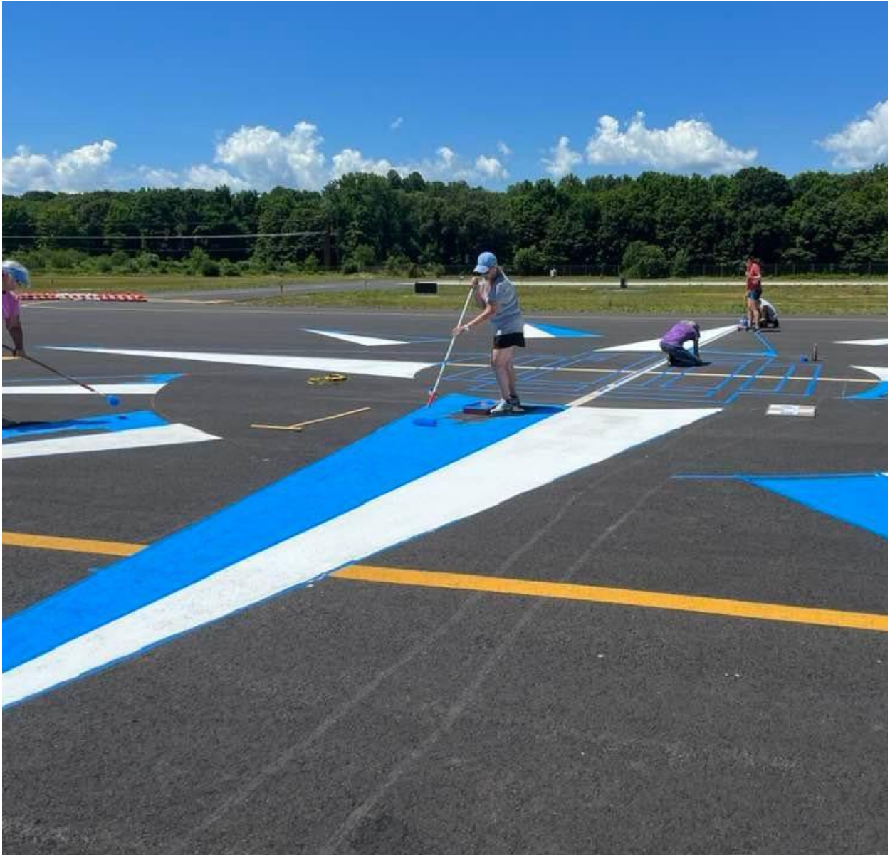
The Airmarking Event at KMMK on June 25th was a great success!