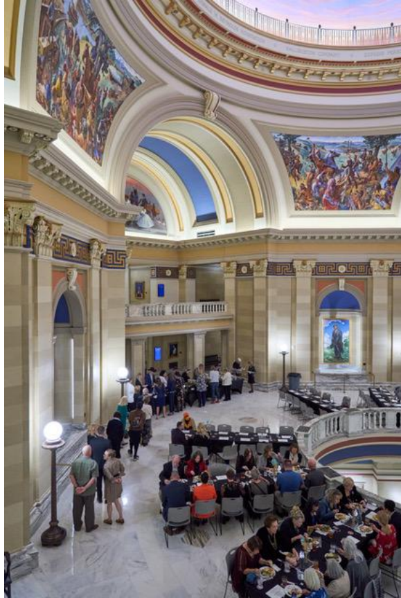
Dinner under the dome