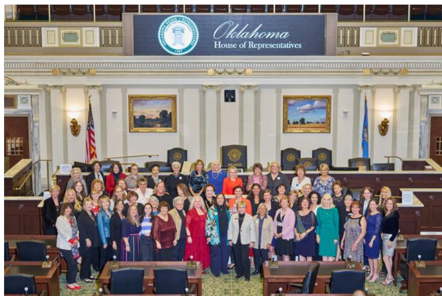
All the 99s, honored for the 95th Anniversary in the Oklahoma State House.